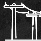
POWER TRANS- MISSION